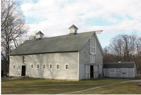
Justamere Pony Farm

Ryan Petronelli's Justamere Pony Farm has moved from Bethel, Connecticut, to Ridgefield, Connecticut. The new farm is larger with more stalls and paddocks. Ryan's currently accepting students for beginner to top-level show training at affordable prices. The Ridgefield location features almost 20 acres, 26 stalls, a 100 by 200 foot outdoor ring with fiber mix footing, a large indoor ring, a heated viewing room, new paddocks and onsite-living staff. The Bethel farm has been transitioned to a retirement facility with 20 professional-care stalls available. For more information, and to schedule a tour, call 203- 650-9238 or visit facebook.com/justamereponies .