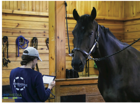
BarnManager is accessible from smartphone, computer or tablet